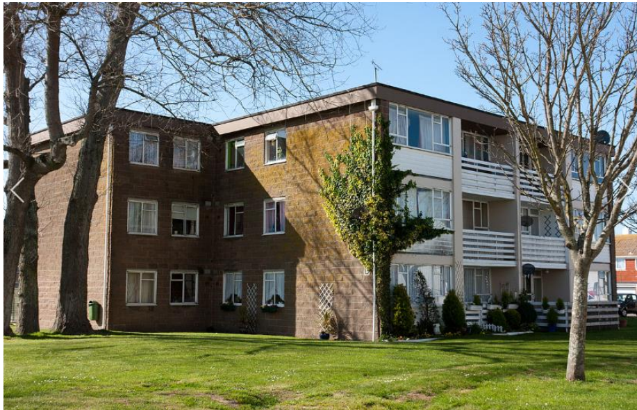
Street View (stock image)